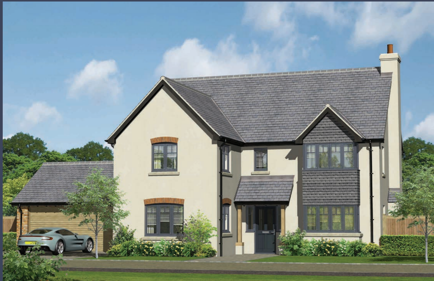
Plot 13 / Artist's impression

The Willcott has a lovely entrance porch and bay window which creates a characterful home. The spacious kitchen and family breakfast area has bifold doors to the rear. The living room with feature fire place has French doors on to the garden. The property also benefits from a separate study that could be used as a formal dining room, snug or even play room. On the first floor there are four bedrooms, two of which have ensuite bathrooms with a further, family bathroom. The property also has a double garage.