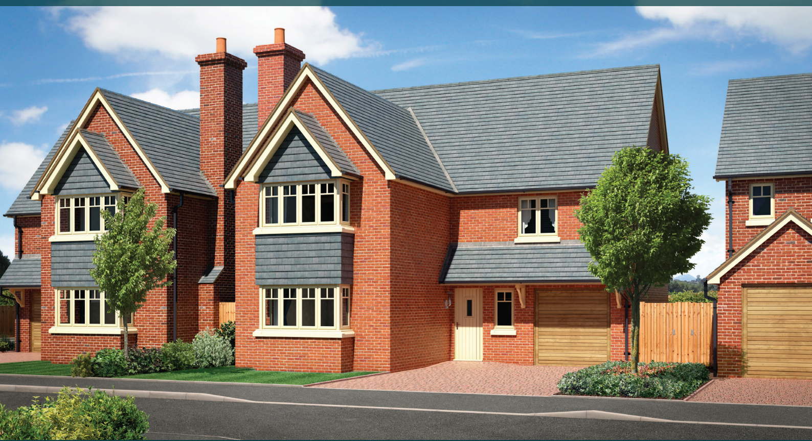
PLOTS 30 (left hand) & 24 & 29 (right hand)