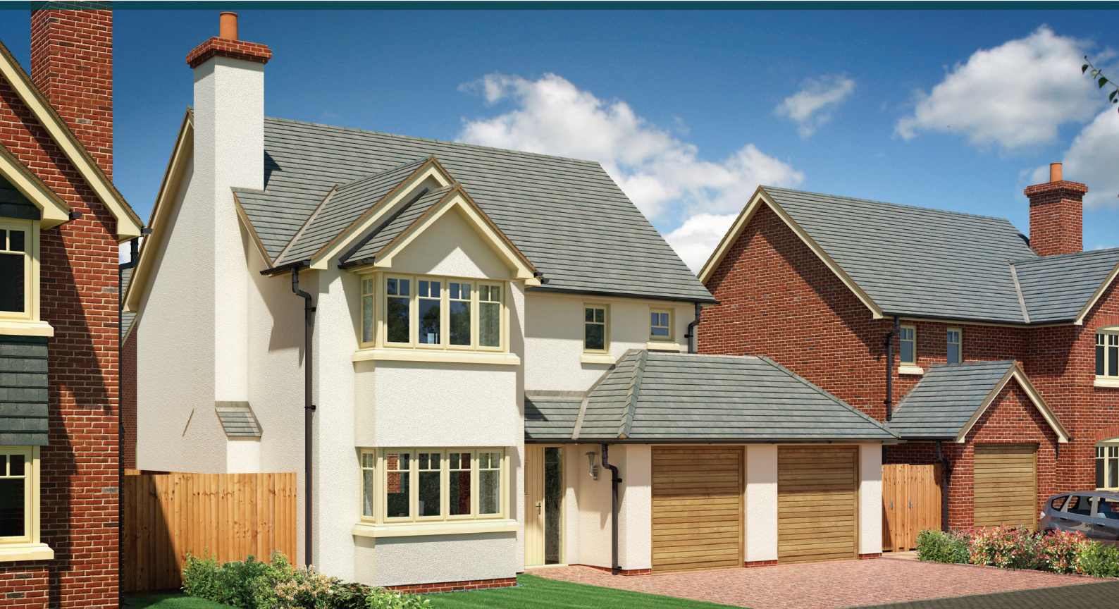
PLOTS 2 & 26